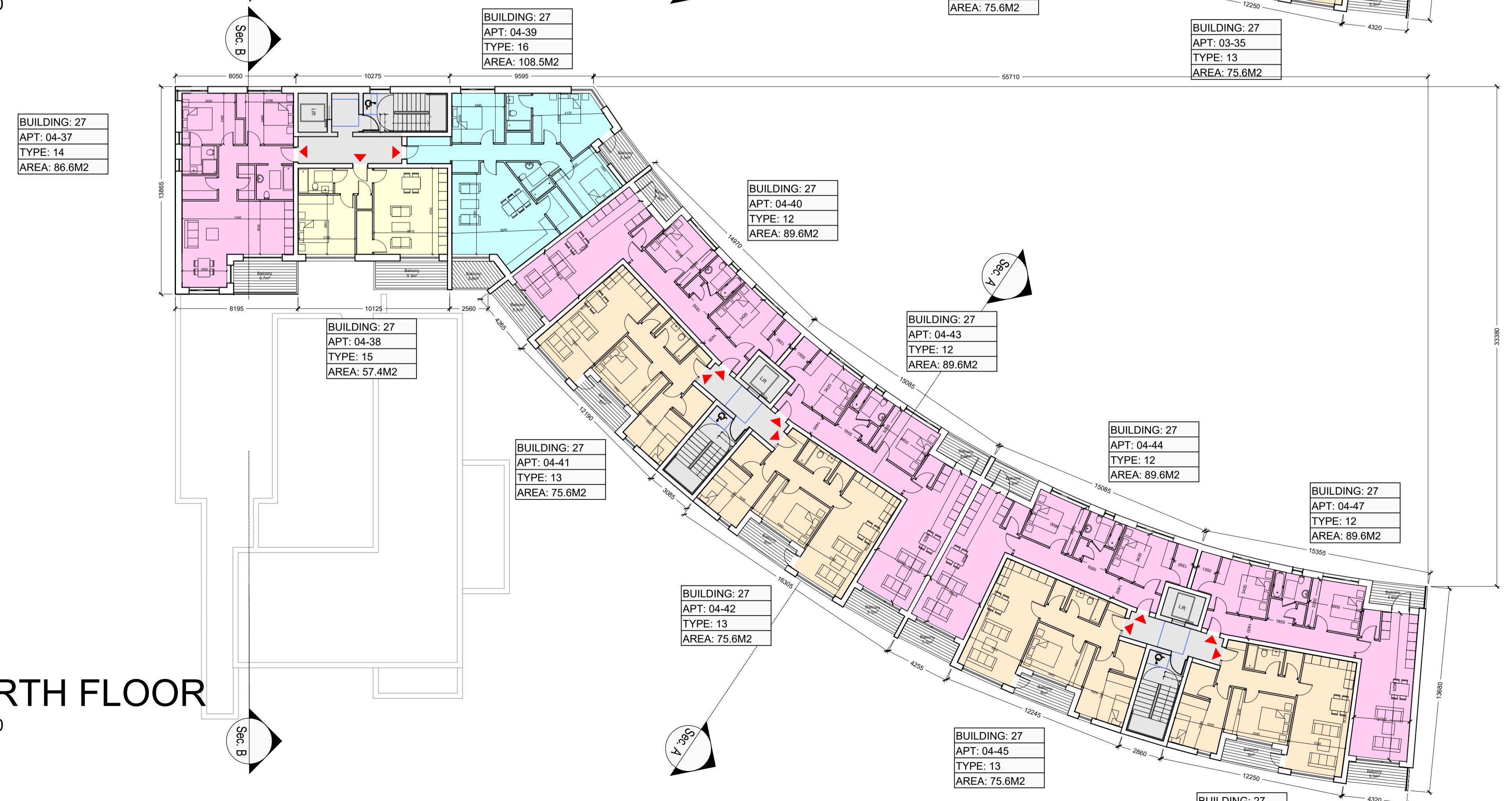
FOURTH FLOOR Scale 1:200

WILSON ARCHITECTURE OMM | W 31 Patrick's Place, Wellington Rd., Cork t: 353-21-455255 e: info@wilsonarchitecture.ie 36 Pembroke Rd, Dublin 4 t: 353-1-4601866 w: www.wilsonarchitecture.ie